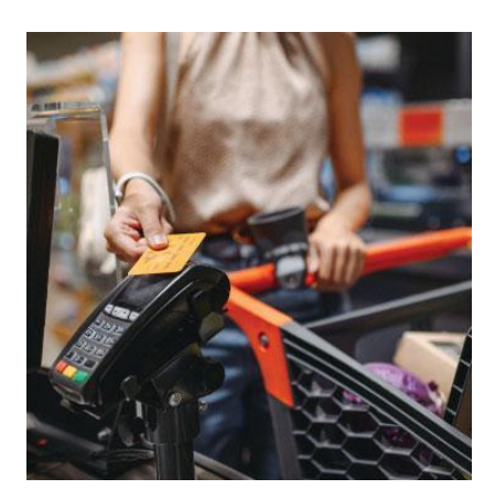
Relying on Credit For Necessities