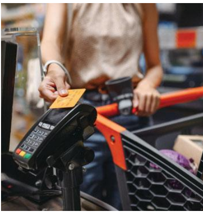
Relying on Credit for Necessities