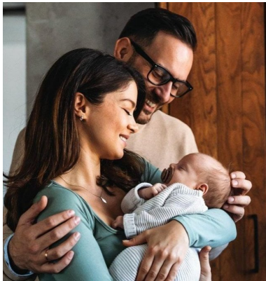
Your Credit Union: A Safe Harbor