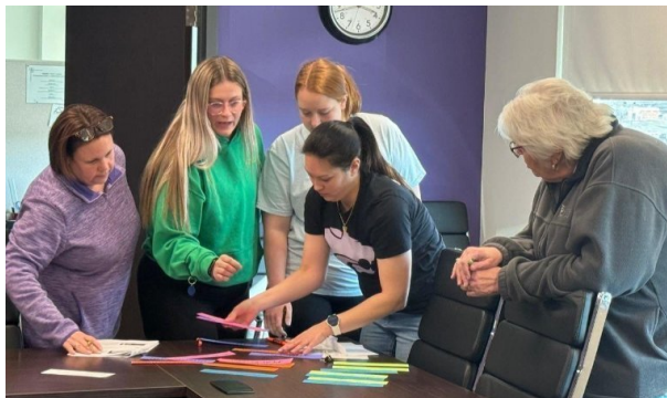
The team training day included some healthy competition where team members tested their skills learned about different processes.