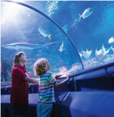
Get a Head Start on Your Next Vacation