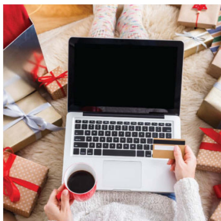
Protect Yourself from Fraud During the Holidays