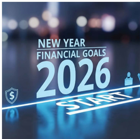
5 Resolutions to Trim Spending & Reduce Stress