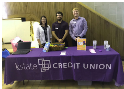
The team poses for a picture with their table set up at the event.