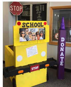
The Campus branch created a memorable lobby display that resulted in many school supply donations.

Stuff the bus was on Saturday, July 22 in front of the Manhattan Walmart. The event was from 10:00am to 3:00pm and successfully raised over $12,500 worth of school supplies for USD 383. Although it was a very warm summer day (105 degrees at its hottest), everyone at the event was eager to help and do their part for children in need. kstate CREDIT UNION also collected donations in their lobbies for the two weeks prior to the event at Walmart.