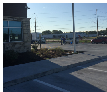
Cars line up in the 601 McCall Road parking lot for the free shred event.

Members have asked for kstate CREDIT UNION to host a community shred event and the opportunity was given on Saturday, October 7. Credit union members and community members arrived at our 601 McCall Road location and safely disposed of their important household paper documents. In addition to the event, kstate CREDIT UNION collected food items for the Flint Hills Breadbasket as a way to give back to our community and SHRED HUNGER. In the two hours of the event there was 95 lbs of food collected and $15 of cash donated. The event was such a success that Document Resources is already reserving a Saturday in Fall 2018 for the credit union to host another event.